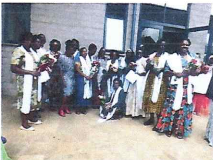
SOS mothers graduation